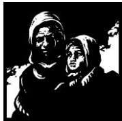
"Blessed are they..." ---Matthew 5:4

In a culture obsessed with strength and success, today's readings are startling. The qualities and behaviors identified in the Beatitudes look nothing like economic, political or social strength. Instead, they appear to demonstrate weakness. Paul tells us that God chose the foolish, the weak, the lowly and despised to shame the wise and the strong. Those of us who say we follow Jesus have some soul-searching to do. How do the Beatitudes fit with our professional and life-style commitments? How willing are we to engage in the really hard practices? And what would it mean if we don't want to?